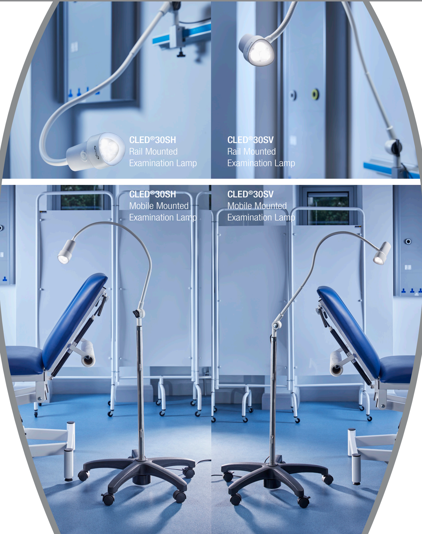
CLED®30SH Rail Mounted Examination Lamp